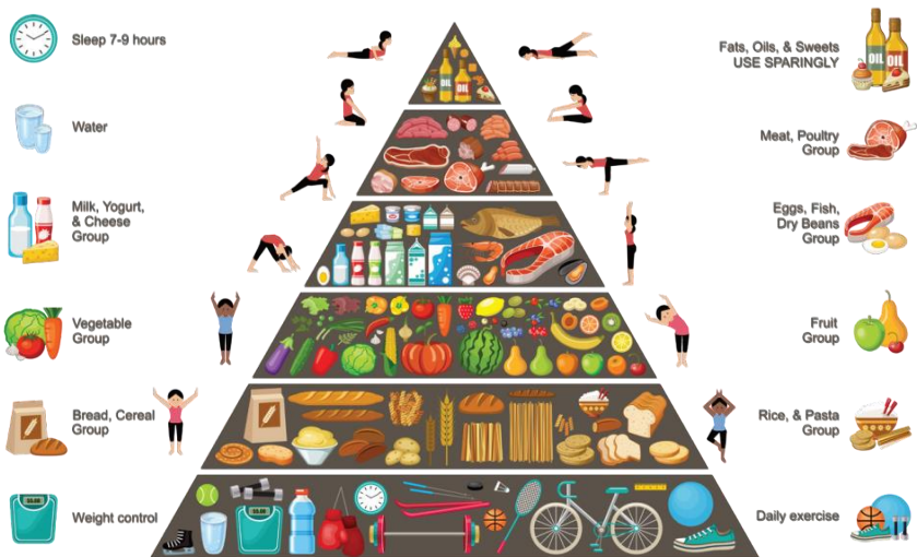
Daily Nutrition and Activity Balance