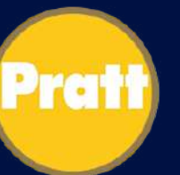
Pratt Institute NYC