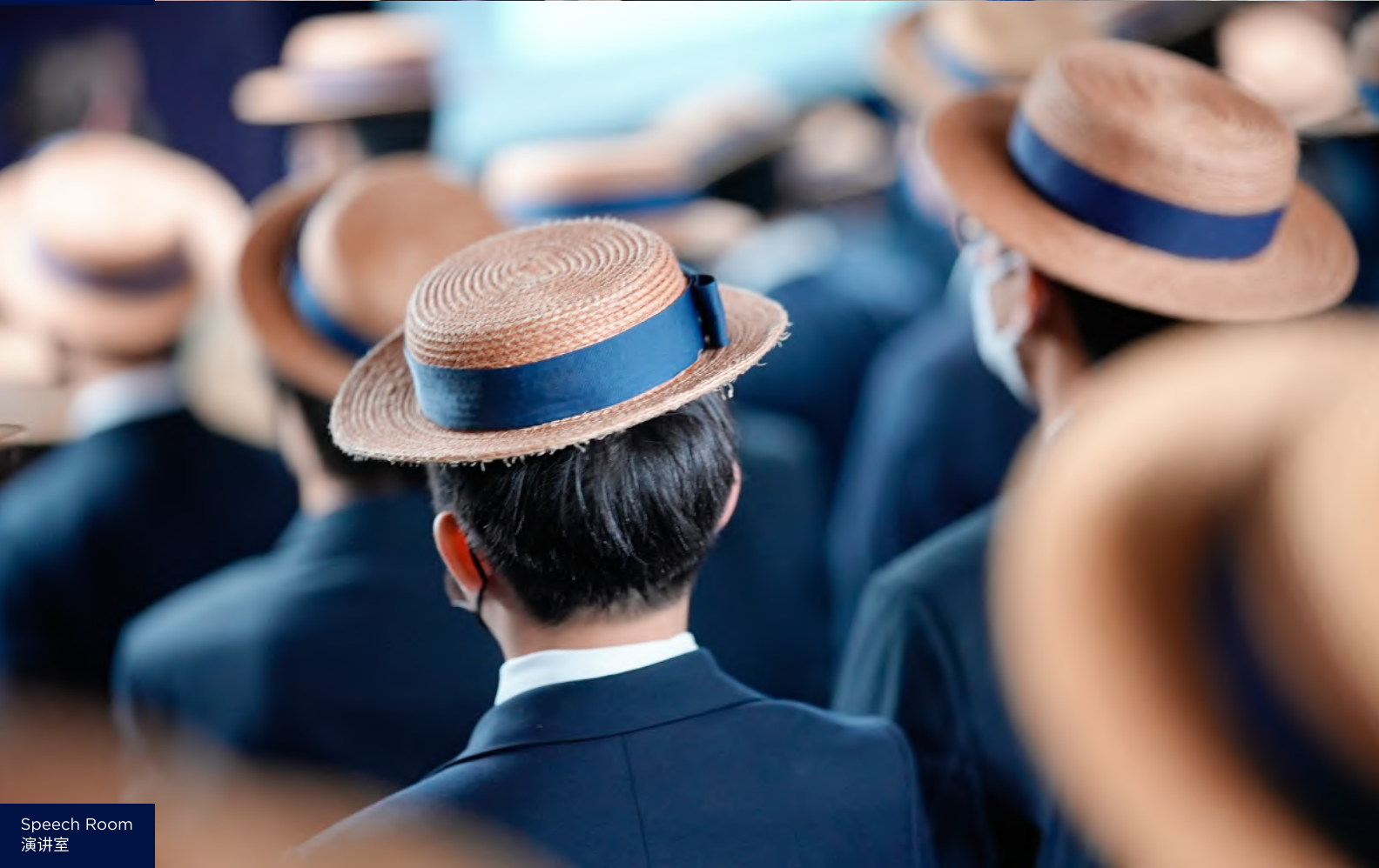
Speech Room 演讲室