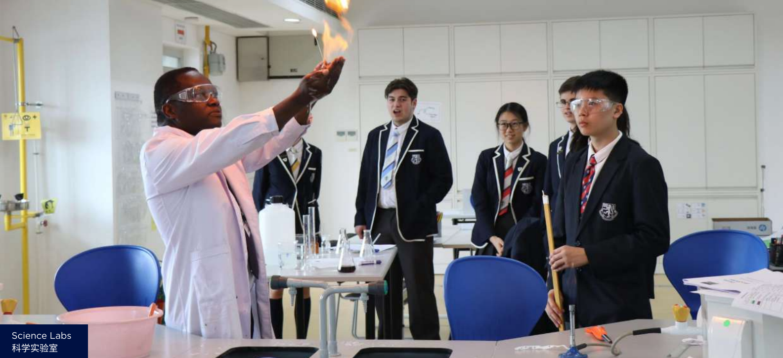
Science Labs 科学实验室