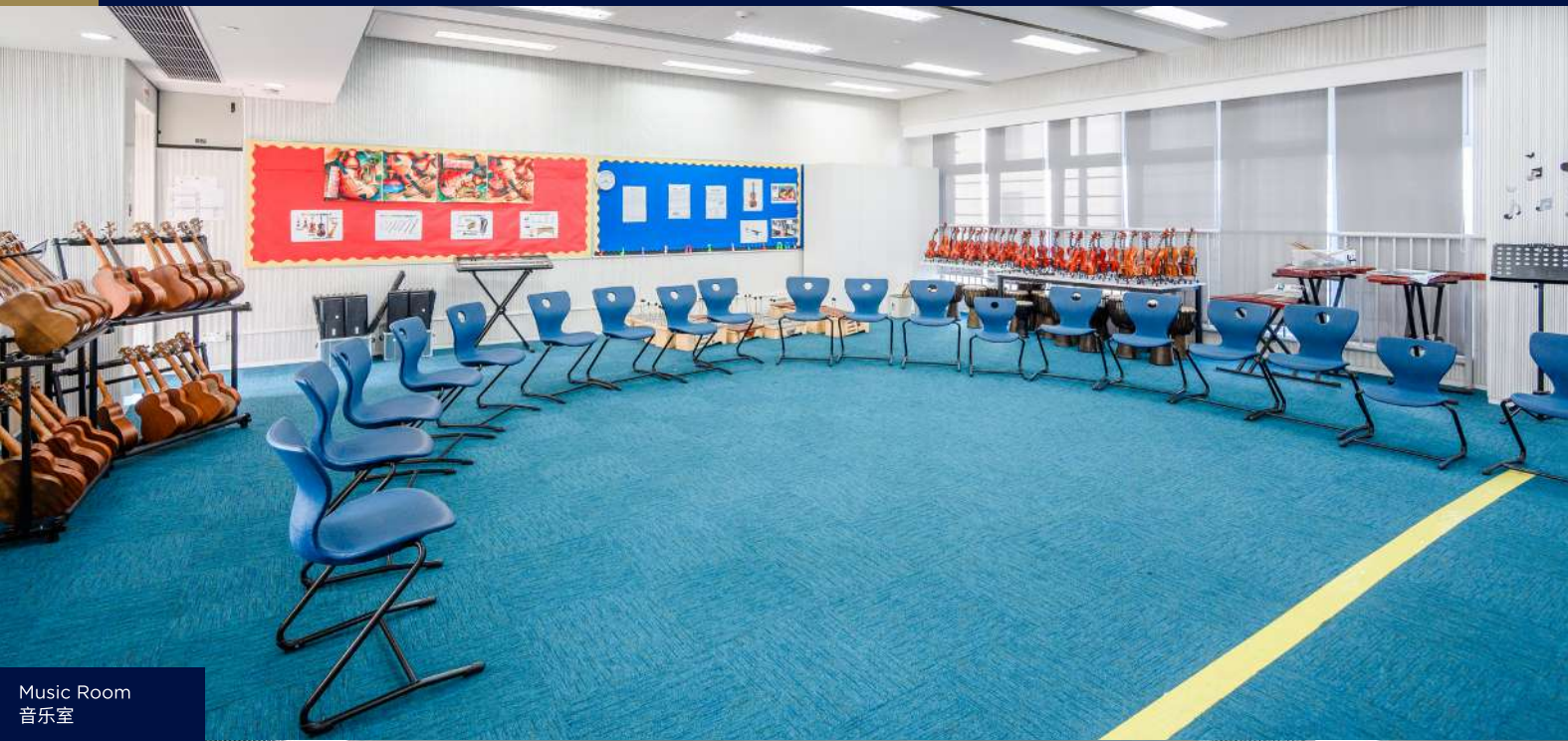
Music Room 音乐室