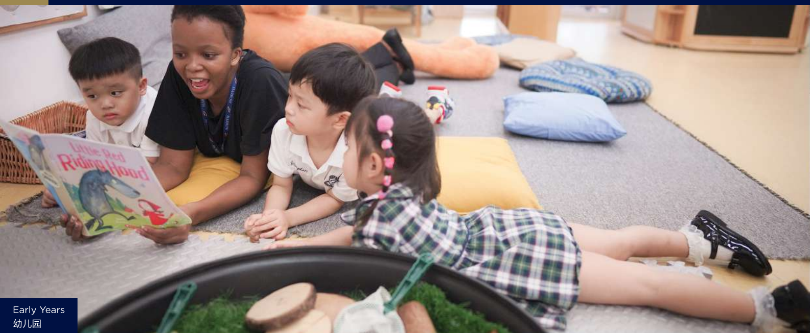
Early Years 幼儿园