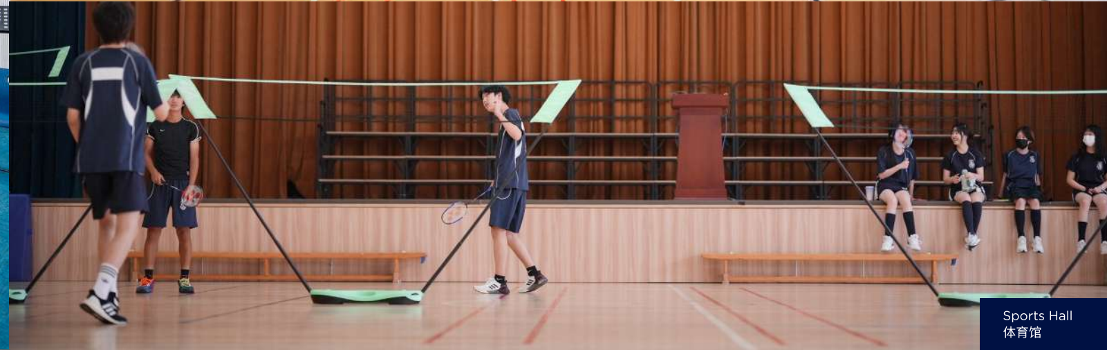
Sports Hall 体育馆