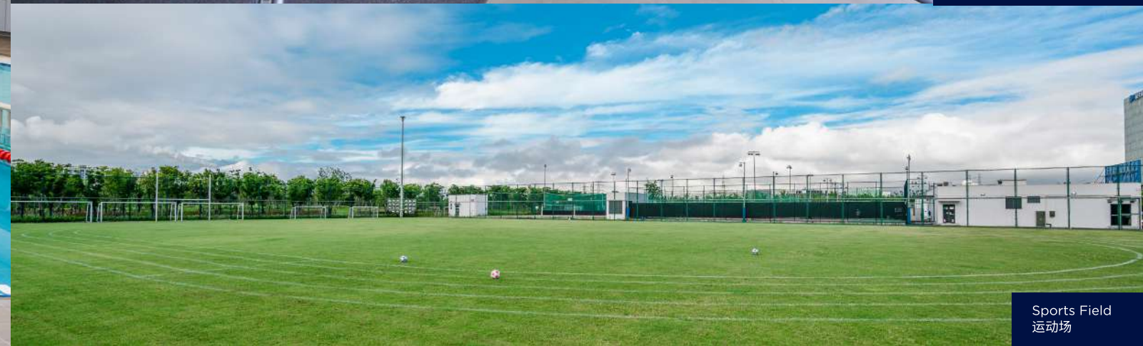
Sports Field 运动场