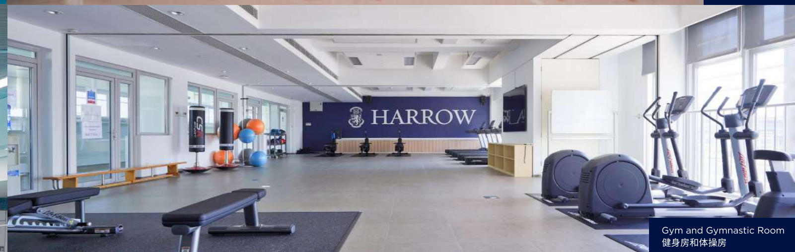
Gym and Gymnastic Room 健身房和体操房