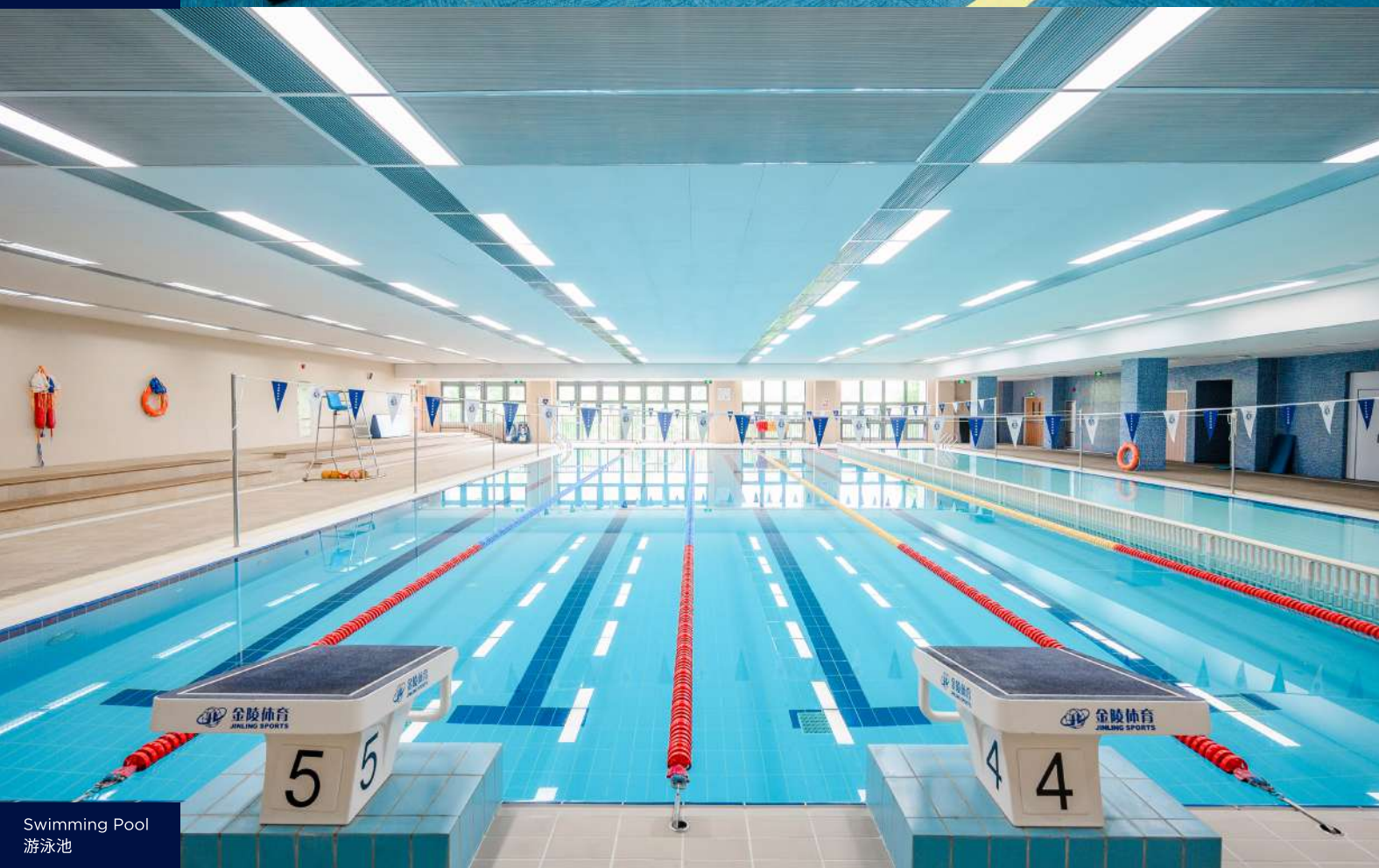
Swimming Pool 游泳池