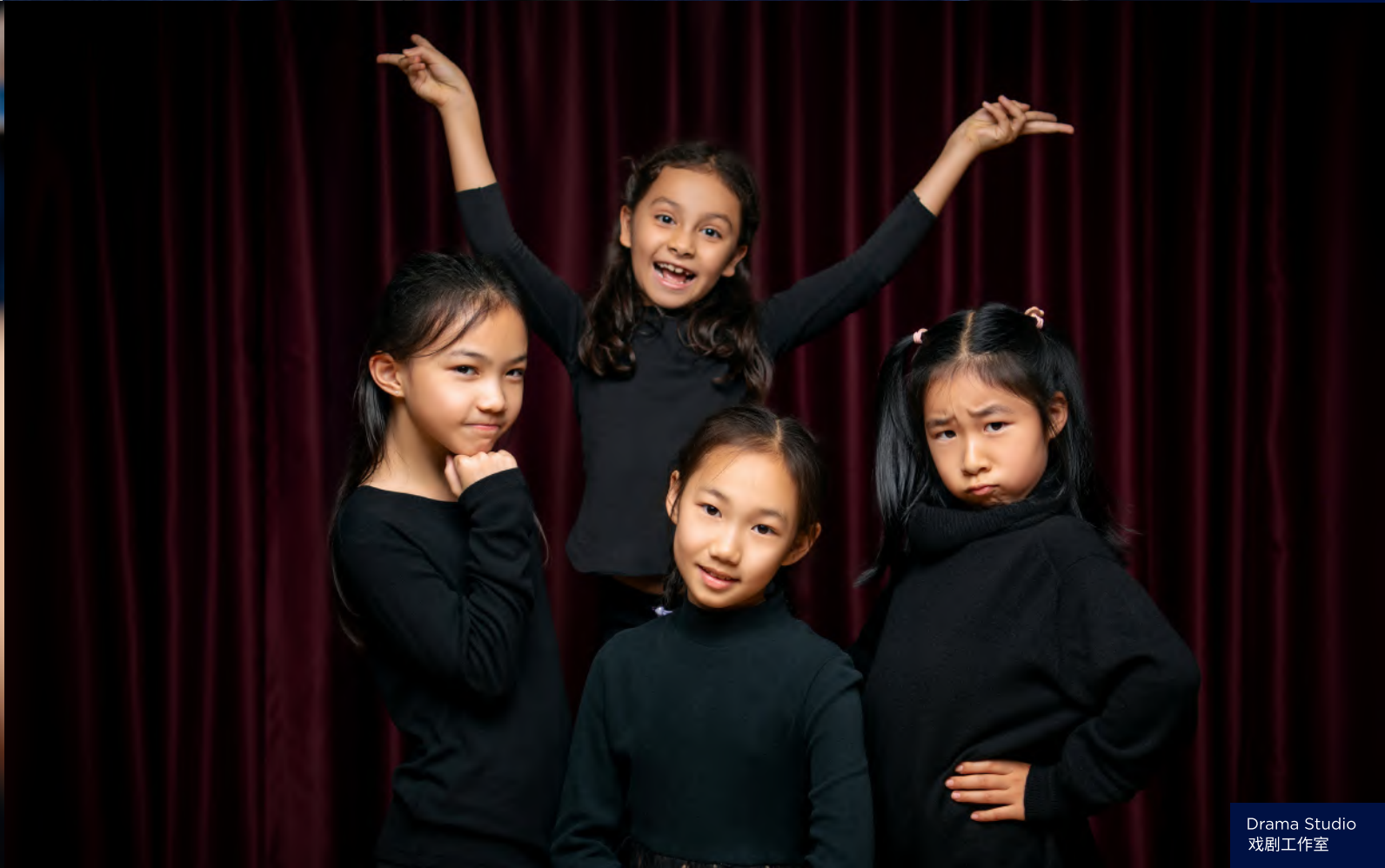
Drama Studio 戏剧工作室