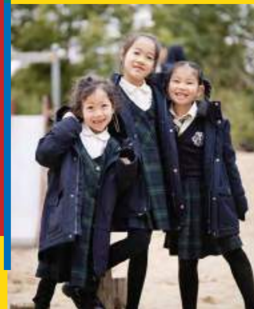
TABLE OF CONTENTS 目录