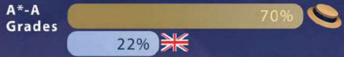
Harrow Shanghai vs UK IGCSE A*/A 哈罗上海 VS 英国本土IGCSE A*/A及A*比例

Once again, Harrow Shanghai students hae achieved exceptional record-breaking results.